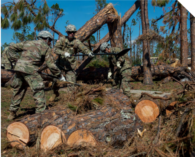
U.S. Army soldiers from the 46th Engineer Battalion moved tree debris into piles on Tyndall Air Force Base, Florida. After Hurricane Michael swept the area in 2018, multiple major commands mobilized relief assets in an effort to restore operations after the hurricane caused catastrophic damage to the base and surrounding communities.

Florida Sentinel Landscape hopes to establish a formal landowner recognition program to acknowledge the significant contributions of local landowners to the Northwest Florida Sentinel Landscape goals and objectives.